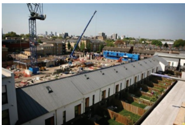
Photo taken from the roof of our phase one development

Following the successful completion of Queensbridge Quarter Phase 1, construction work on Phase 2 of the regeneration development in the Dalston area of Hackney started on site in March. Phase 2 will mirror Phase 1 and comprises 54 private residential apartments and 22 private houses. Two social homes for LB Hackney are also included as part of the development. The three to five storey apartments are of reinforced concrete frame construction and the homes are timber frame. The first homes are due to complete in June 2011.