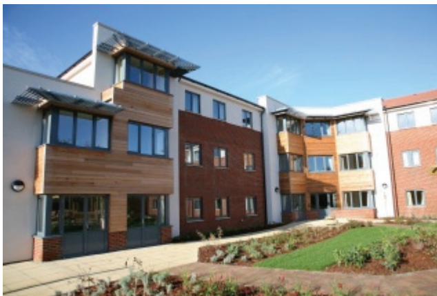
Joseph Hadlum Court, built last year for Housing 21

The signing of these new framework agreements is very promising for the future expansion and financial success of United House going forward into 2011. It demonstrates our versatile reputation for excellence in delivering high quality refurbishment and new build social housing across a variety of different tenures.